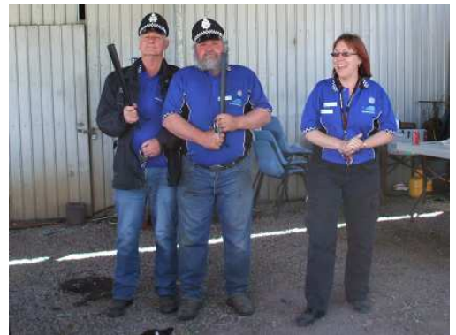
The new look “yellow card” Marshalls