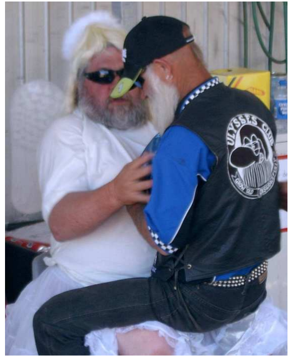
She is immediately set upon by one of the sex-crazed citizens