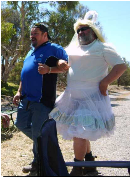
“Got Knackered” arrives at the Christmas party. Reminds me of that comment “when ordering a Mail-order Russian Bride remember to check the fine print”