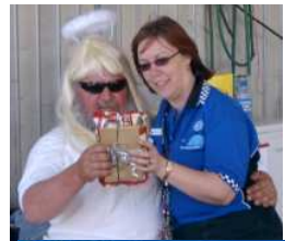
I think it needs batteries to give you a thrill dear!!!